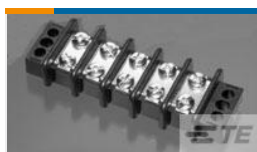
TE Part # 1-1546307-1 11P.374" DR BARRIER,W/WASHER